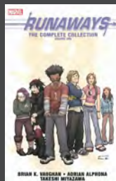
Runaways by Brian K. Vaughan Graphic Novel