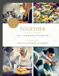
Together by The Hubb Community Kitchen Adult Non-Fiction

Find more stories on the power of community: https://bit.ly/SPLTogether