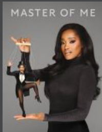
Master of Me By Keke Palmer