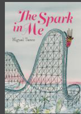
The Spark in Me By Miguel Tanco