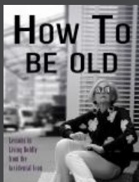
How To Be Old By Lyn Slater