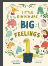
Little Dinosaurs, Big Feelings By Swapna Haddow